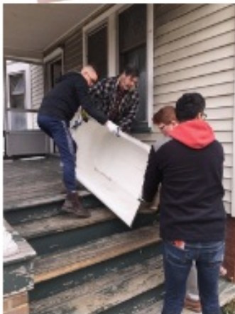
No job is too big!!